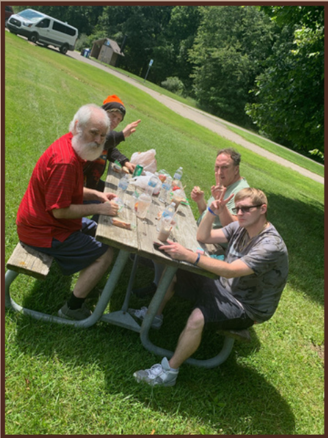
Stony Creek Park Jewell Pointe