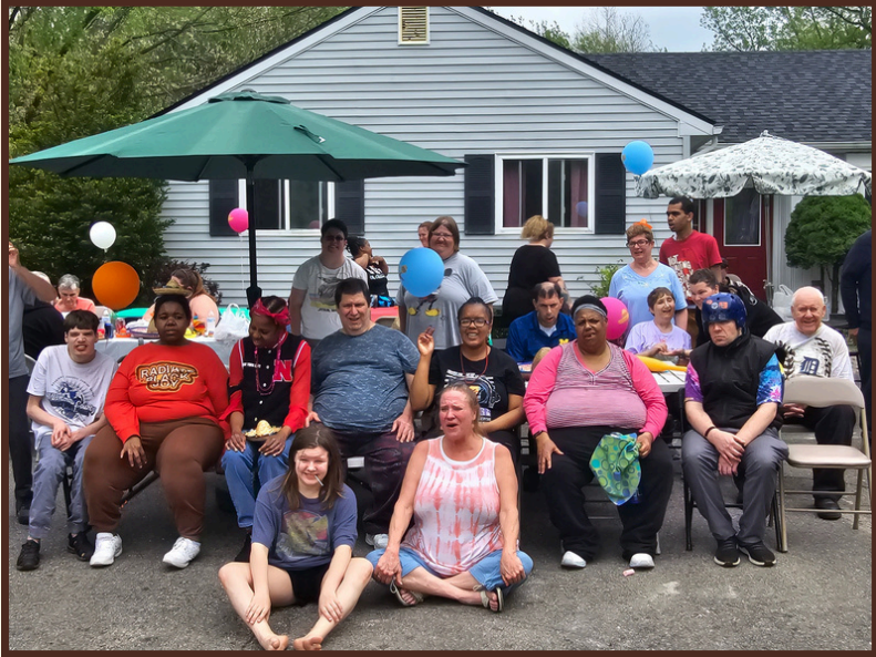
Cinco De Mayo Party Briarwood

Let's take a look and see what our homes did throughout the quarter!