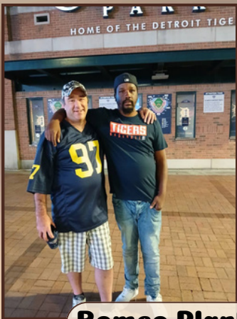
Romeo Plank Residents