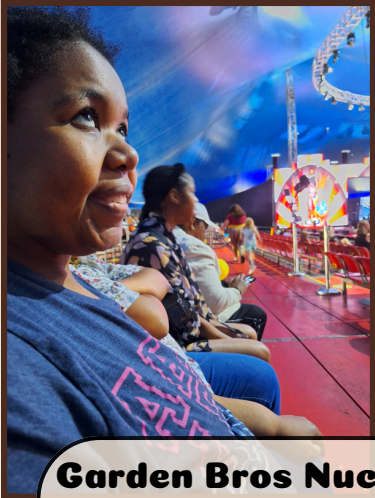
Garden Bros Nuclear Circus Seybold